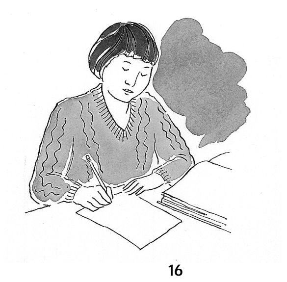
The Resume Workbook for High School Students / A Fill-in-the-Blanks Guide — Yana Parker, © 2001